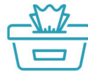
Disinfectant Wipes or Spray