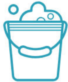
Warm, Soapy Water